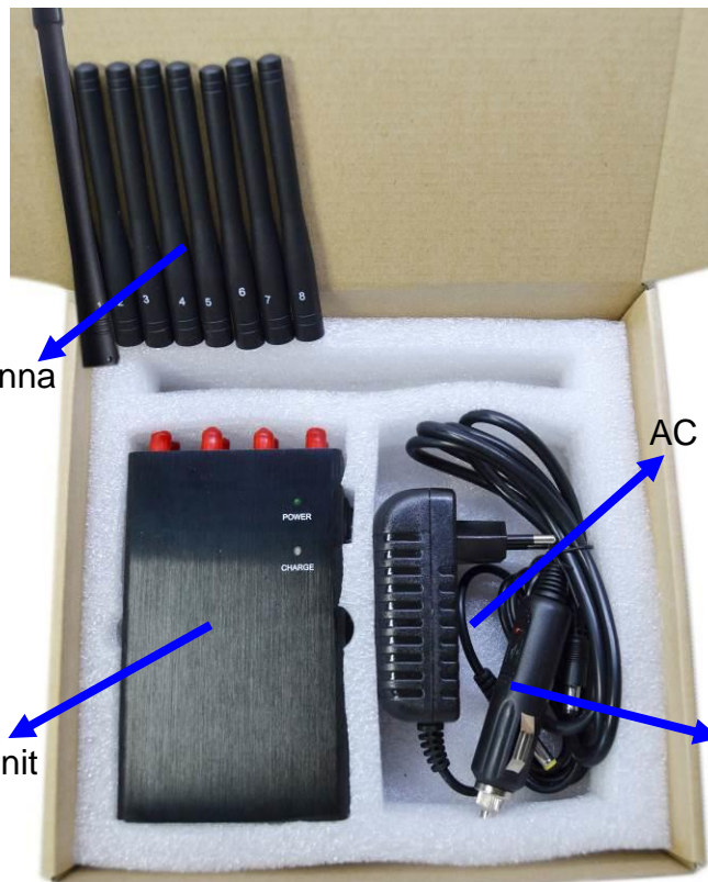
AC Power adapter